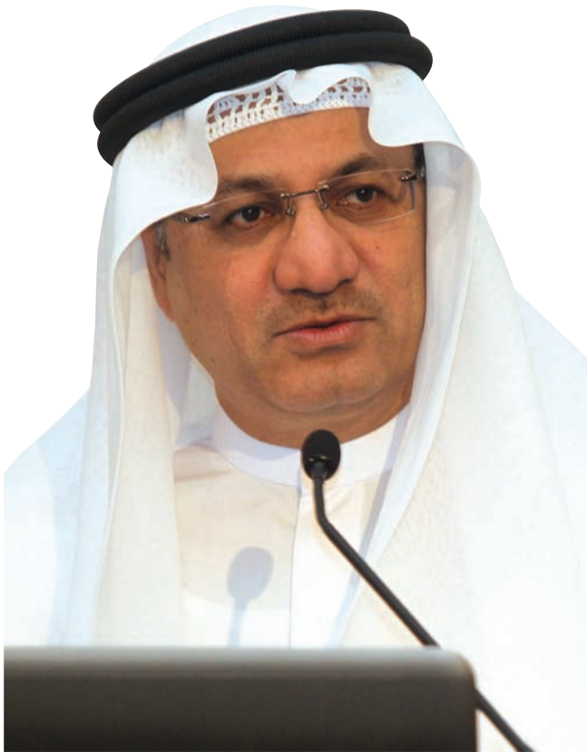
H.E. Minister of Education, Chairman of Hamdan Award Board of Trustees at his speech