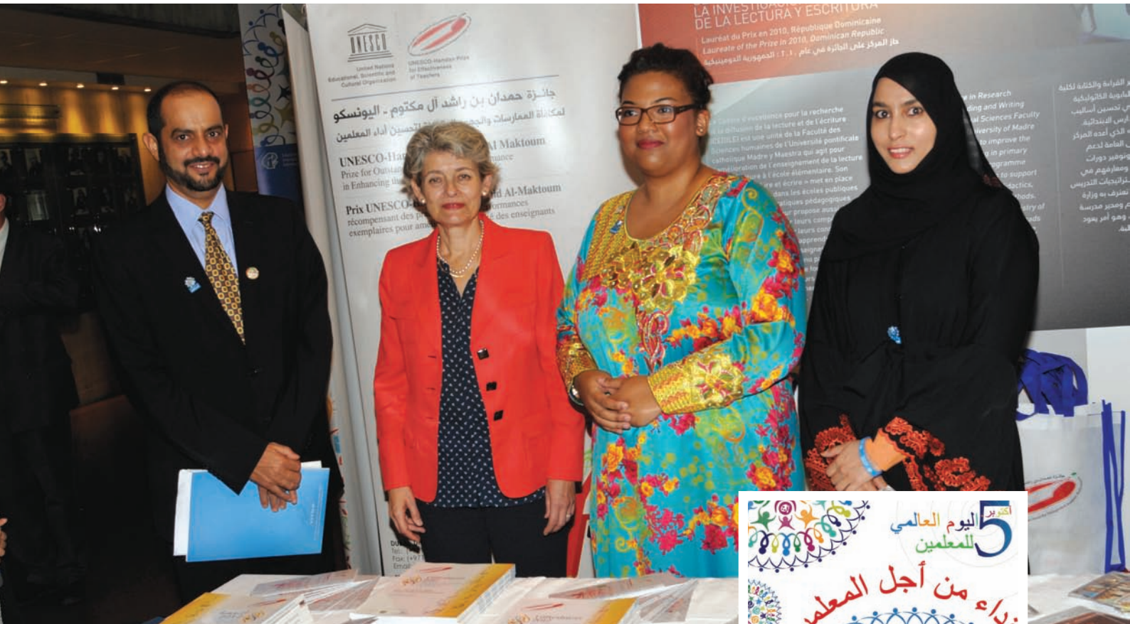
Irina Bokava visiting Hamdan Award Pavilion